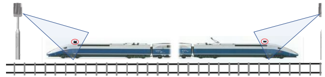
Figure 3- 802.11ad 70 GHz access network

By using the 5G SA networks, we can satisfy the requirements of the services, in terms of high data rate and low latency, and more importantly seamless connectivity across the border with low mobility interruption time. The seamless connectivity is provided with the support of: